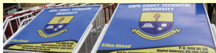
Some of the donated signposts.