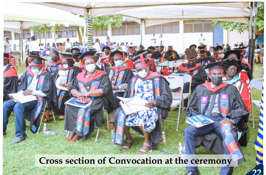
Cross section of Convocation at the ceremony