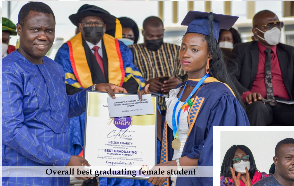
Overall best graduating female student