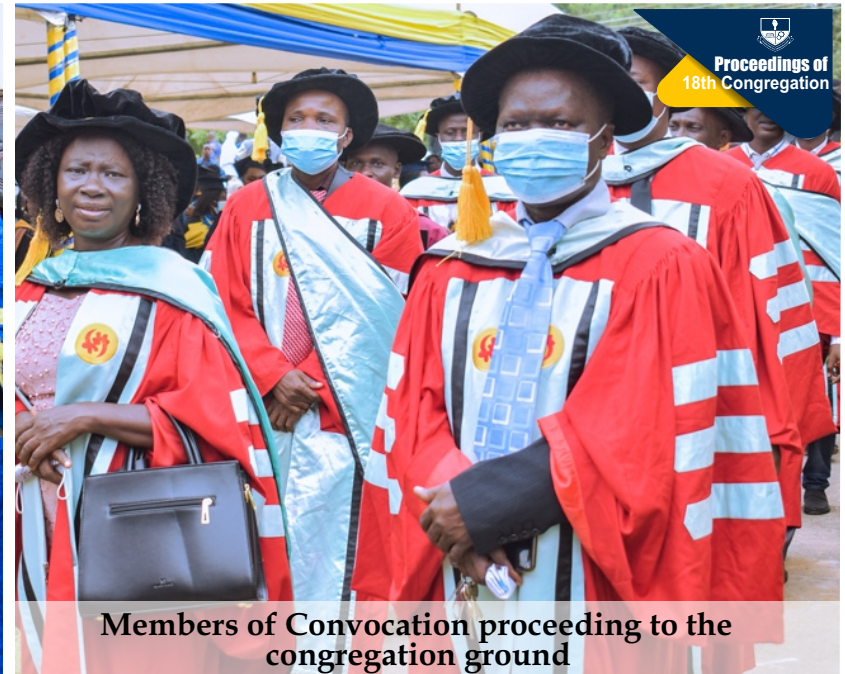
Members of Convocation proceeding to the congregation ground