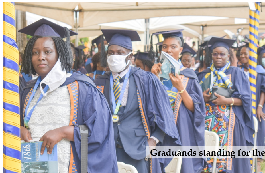
Graduands standing for the Council Chairman's procession