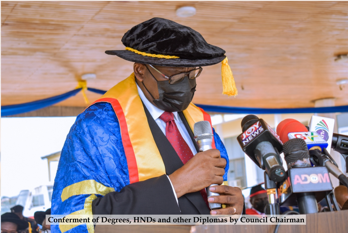
Conferment of Degrees, HNDs and other Diplomas by Council Chairman