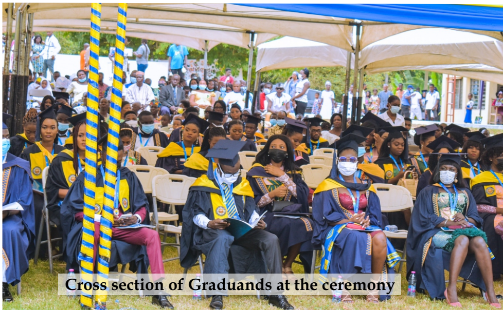
Cross section of Graduands at the ceremony