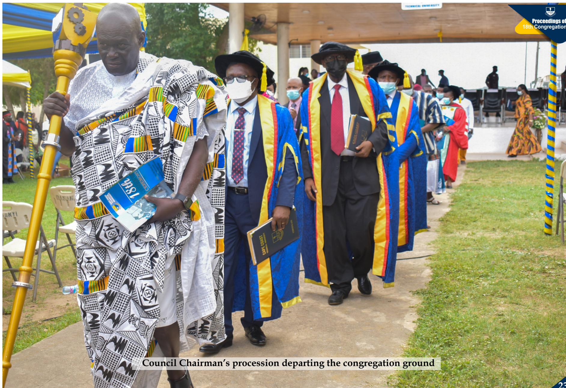
Council Chairman's procession departing the congregation ground