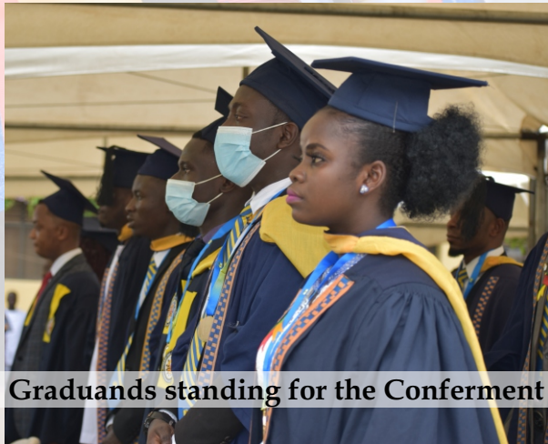
Graduands standing for the Conferment