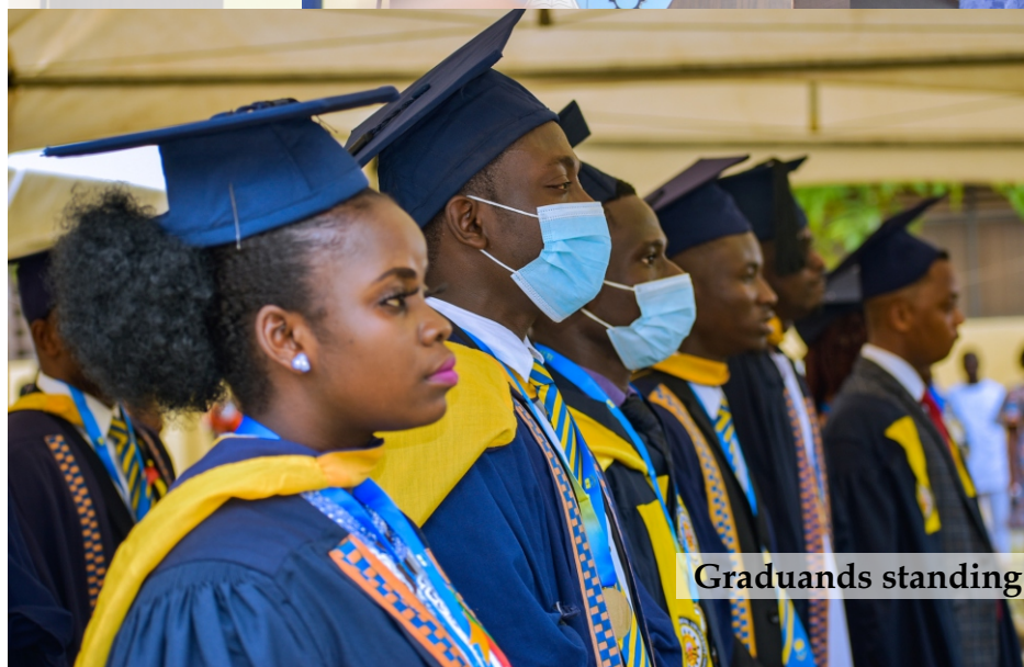
Graduands standing for the CCTU Anthem