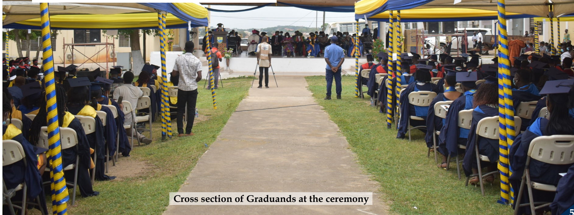
Cross section of Graduands at the ceremony