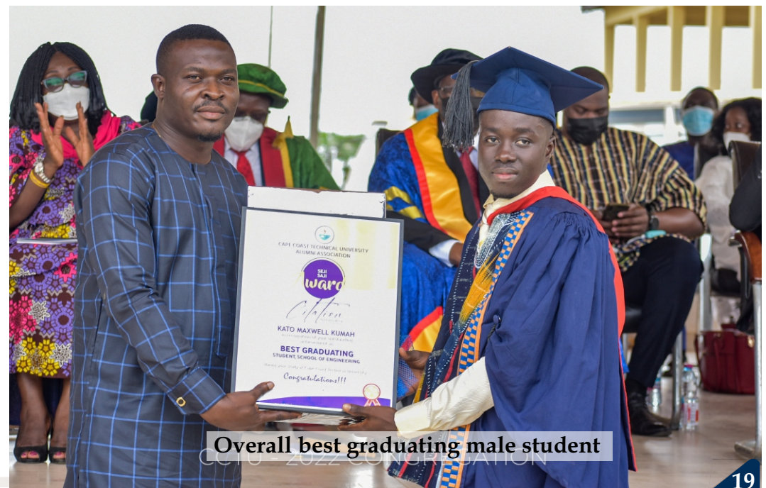
Overall best graduating male student