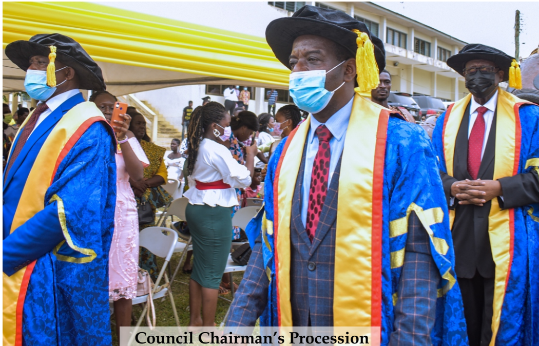
Council Chairman's Procession