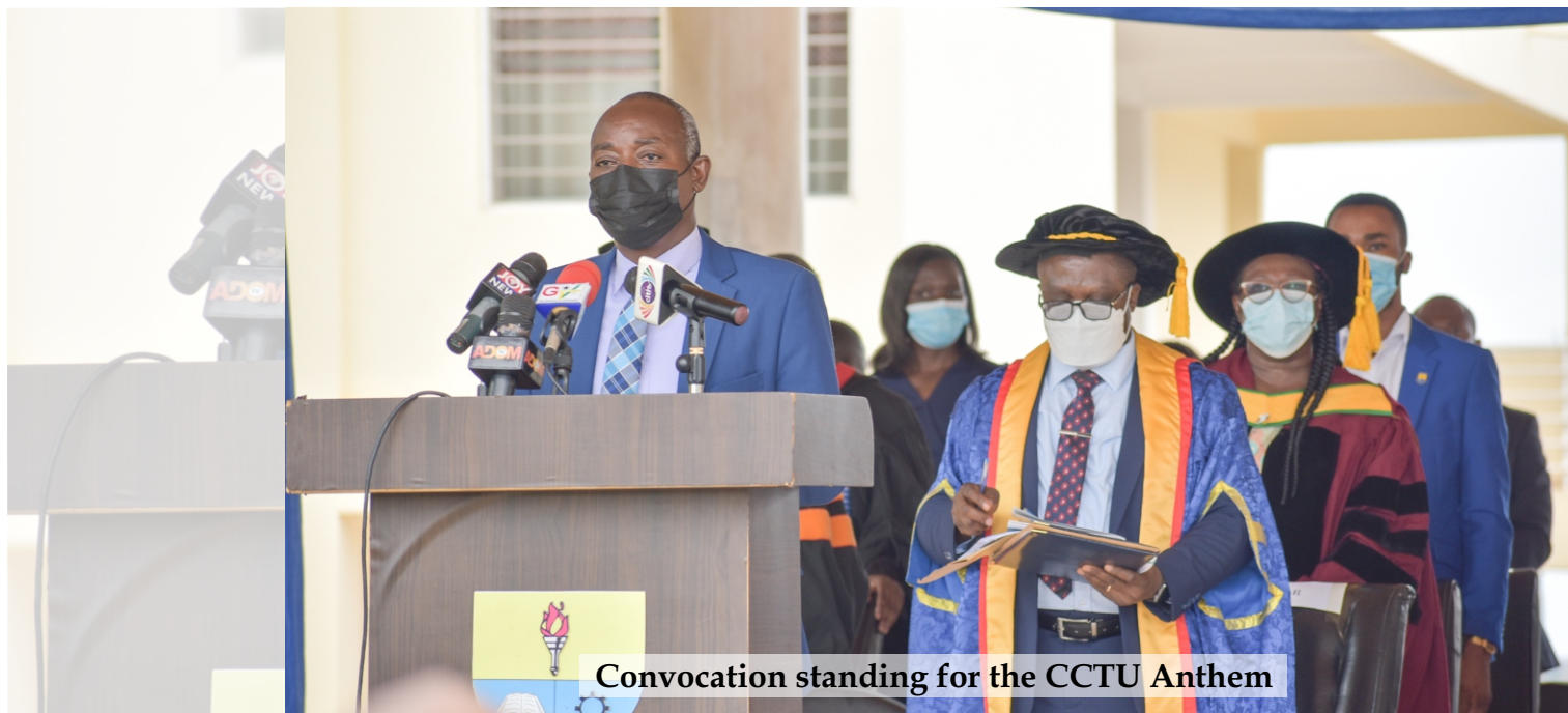
Convocation standing for the CCTU Anthem