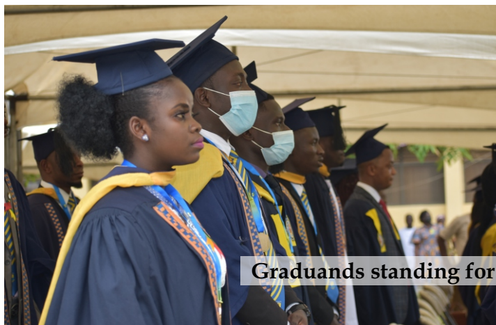
Graduands standing for the National Anthem