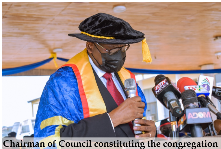
Chairman of Council constituting the congregation