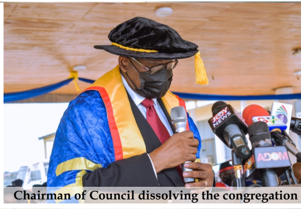
Chairman of Council dissolving the congregation